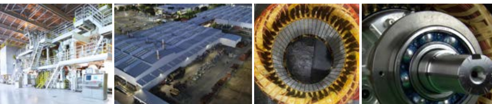
ABB has what it takes to help every industry and application reach new levels of efficiency and energy savings even under the most demanding conditions. Combining the best available materials with superior technology, our motors are designed to operate reliably no matter how challenging the process or application, and to have low life cycle costs.