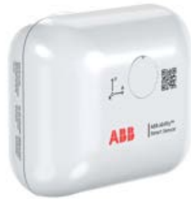
ABB Ability® smart sensor

Based on ABB's extensive know-how, advanced algorithms are used to analyze the data and produce meaningful information such as temperature, vibration, load, number of starts and more. The sensor sends this information directly to a smartphone or gateway and to a dedicated ABB Ability™ Smart Sensor portal. Data is also tracked over time for trend analysis.